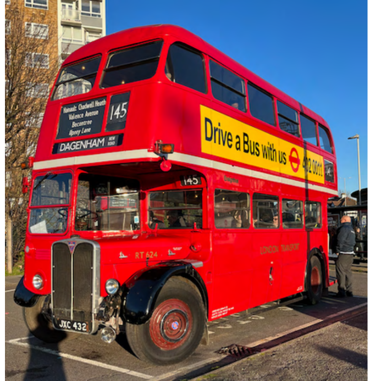
OTHER PHOTOS: EDITOR