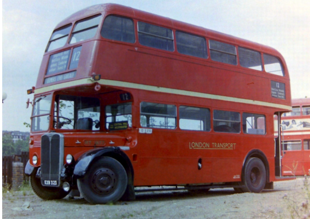
RT 1677 at Battersea Garage when completed in 1985.