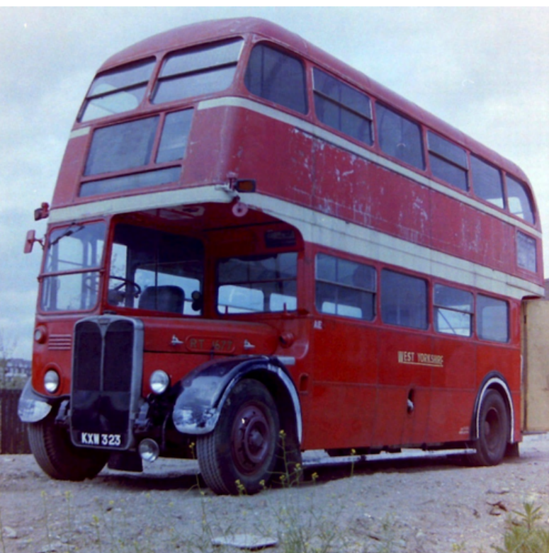
RT 1677 at Battersea garage as purchased in 1984

I progressed to driving in 1976, still at Battersea. I drove route 22, with occasional duties on routes 19 and 31. By 1982 I was driving brand new Metrobuses on Route 39. Whilst at B, I was part of a group of drivers and mechanics who, with the assistance of the late Bill Cottrell, restored RT 1677, which sadly we had to dispose of upon the closure of B in 1985. I then transferred to Victoria garage for the Red Arrow routes 500 and 507.